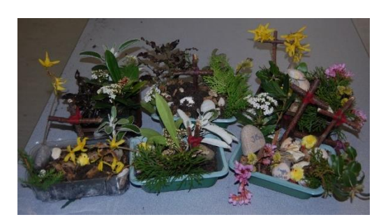
Easter Gardens made by our after school 'Late Bird Club'

Here are some other learning highlights from this year: