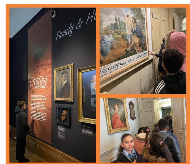
Christchurch Mansion Constable Exhibition