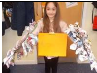
World Book Day dress-up, vocabulary theme.