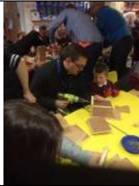
We were so pleased our governors could join us too!