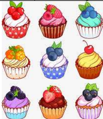
Fortnightly cake sales are our main fundraising events so far this year. Each class takes a turn.