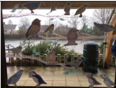
Corridor art work!