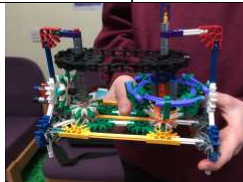
Excellent homework examples from around the school celebrated!