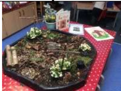
Easter craft around school!