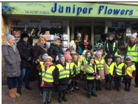
EYFS trip to visit their local florist!