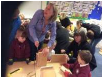
Bird Box making in EYFS!