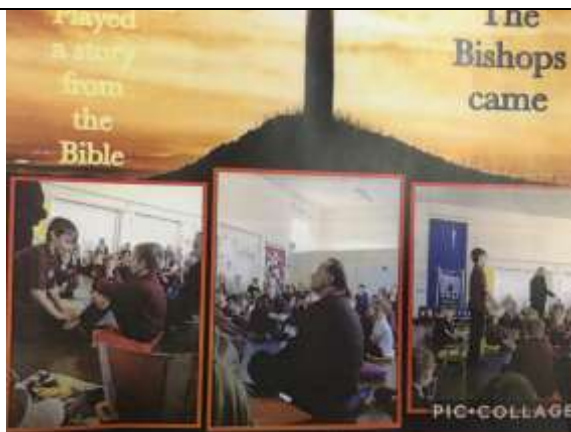
The Bishops came!