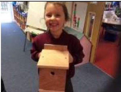
A finished box!