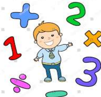
We started the Matific Maths