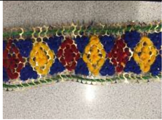
Beautiful weaving! This has now been put with all the others and made into a cross shape.