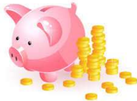
NatWest visited all the classes to talk about money management and simple budgeting and also to talk about employment. We enjoyed these days enormously. We have some good ideas about to further develop this idea next year.